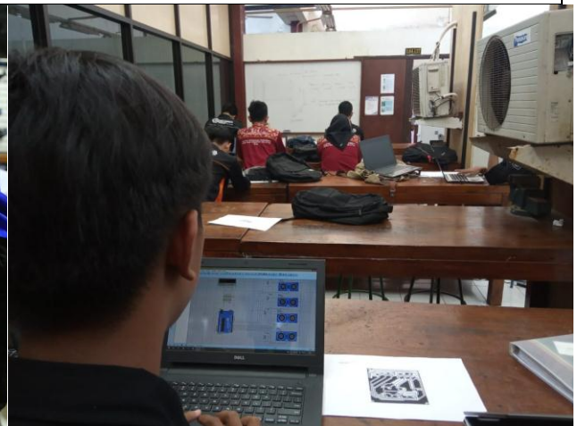
Electricity Usage Laboratory