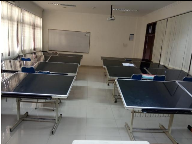
Electrical Drawing Laboratory