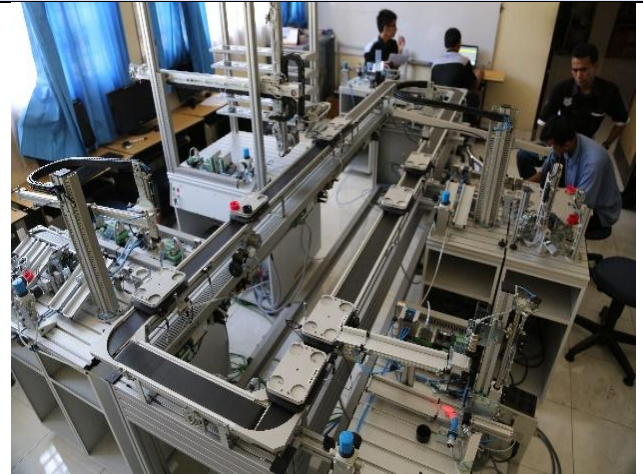
Flexible Manufacturing Systems Laboratory