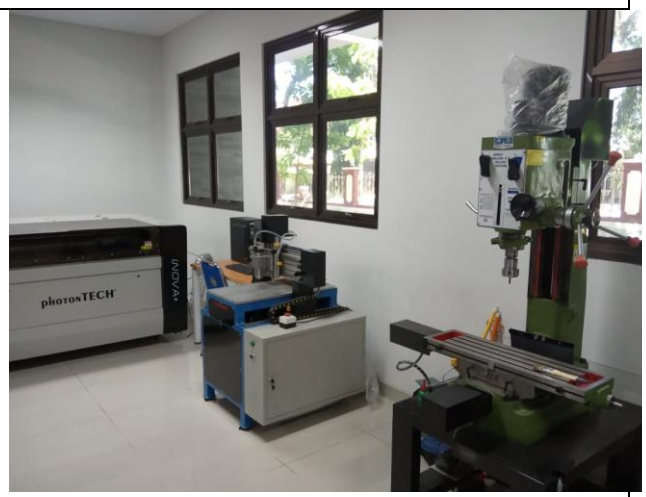
CNC Maintenance Laboratory