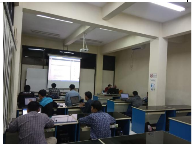
Data Communication Laboratory