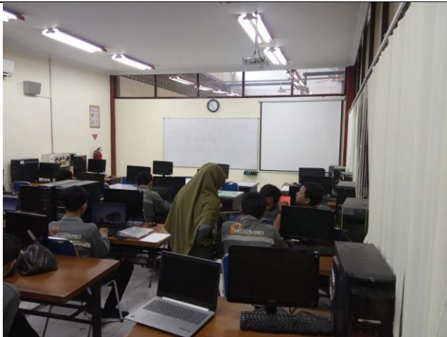
Computer Application Laboratory