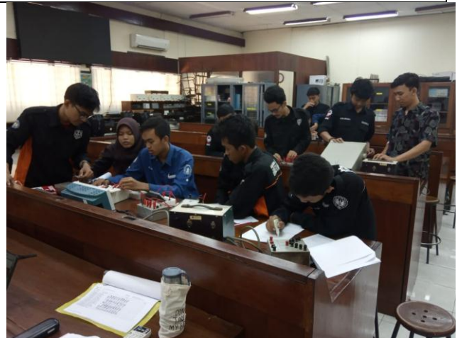
Power Electronics Laboratory