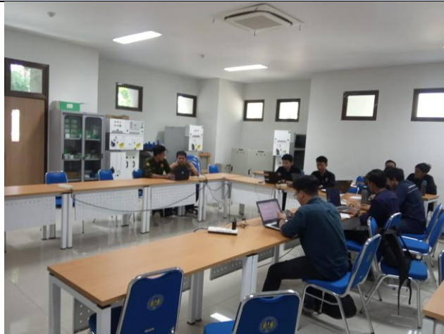
Electric Power Protection Laboratory