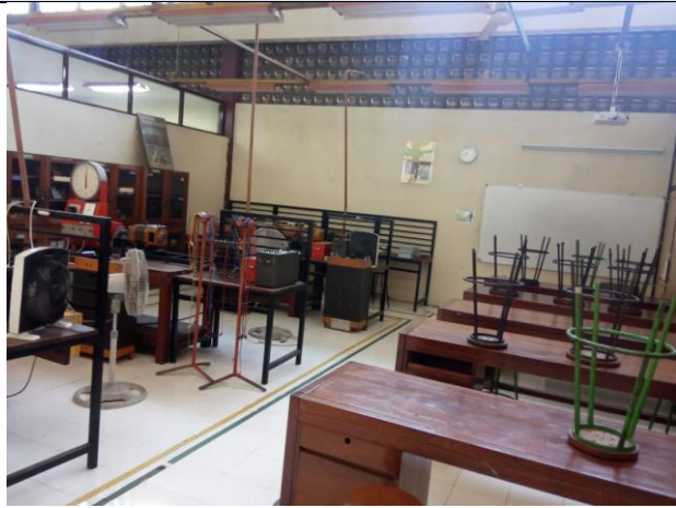
Conversion Laboratory and Electric Power Systems