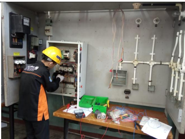
Electrical Installation Laboratory