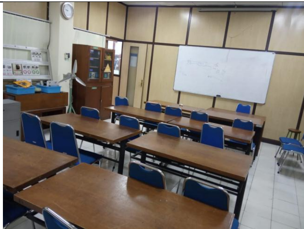
Lab. LICES (Laboratory of Industrial Control and Electrical Safety)