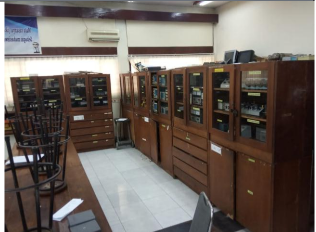
Control Systems Laboratory