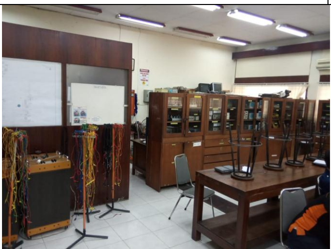
Basic Electrical Laboratory